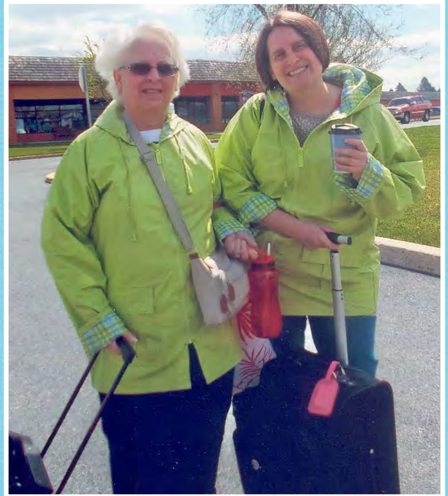
Mom and I enjoy taking bus trips to see plays and go shopping.