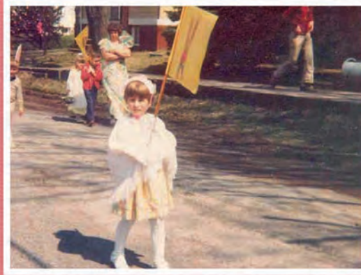
I'm proudly marching in my first parade.