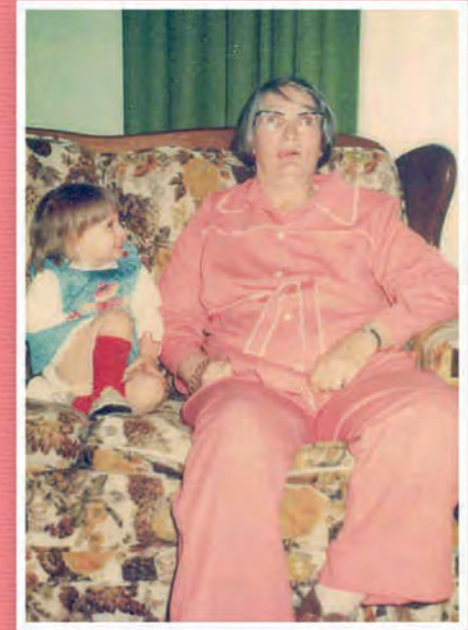
I adored my Grandma.