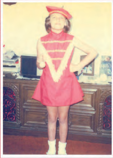
I was a baton twirler.