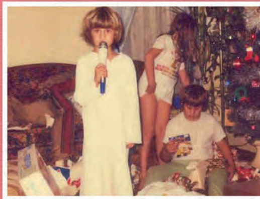
The Christmas I wanted to be a country music singer.