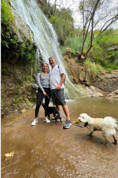
Hiking & enjoying the outdoors