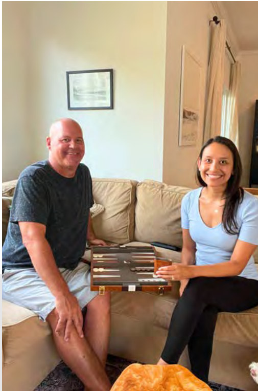
Relaxing at home