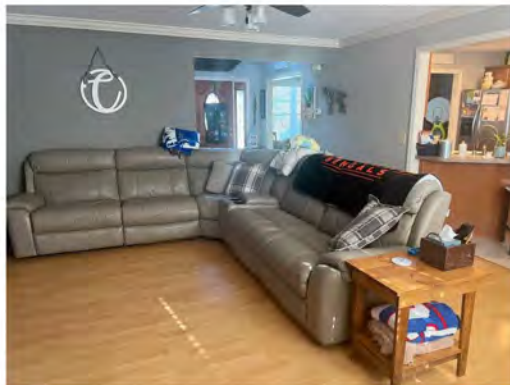
Our family room where we relax, play, and watch movies together.