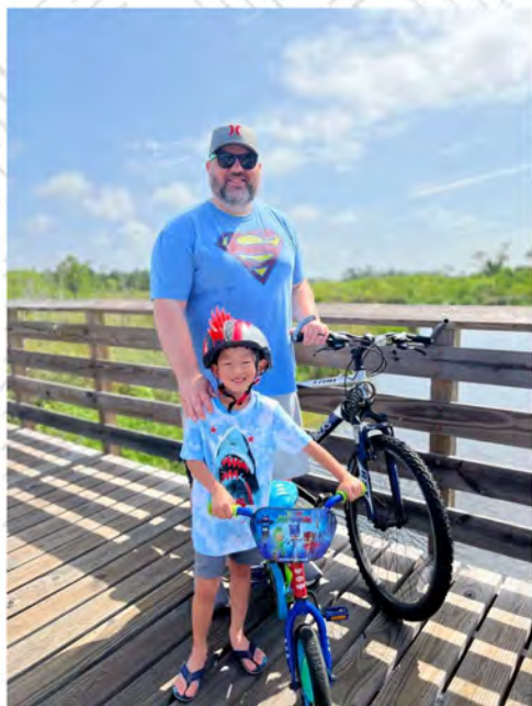
We love to ride bikes and play outside.