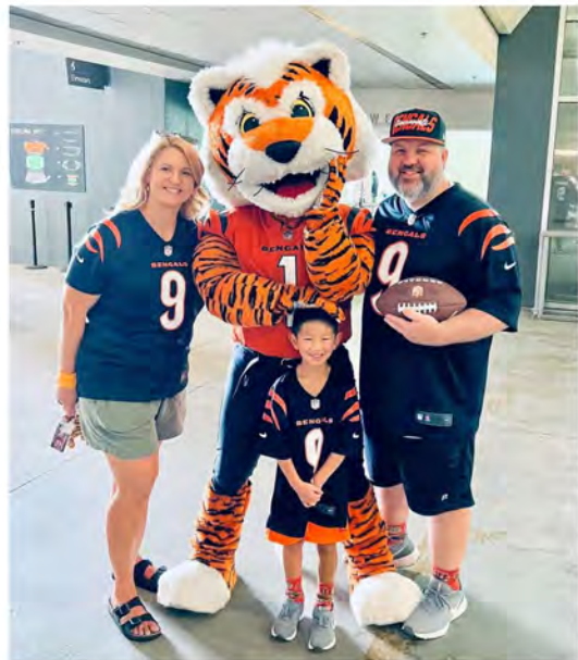
Cheering on the Cincinnati Bengals..