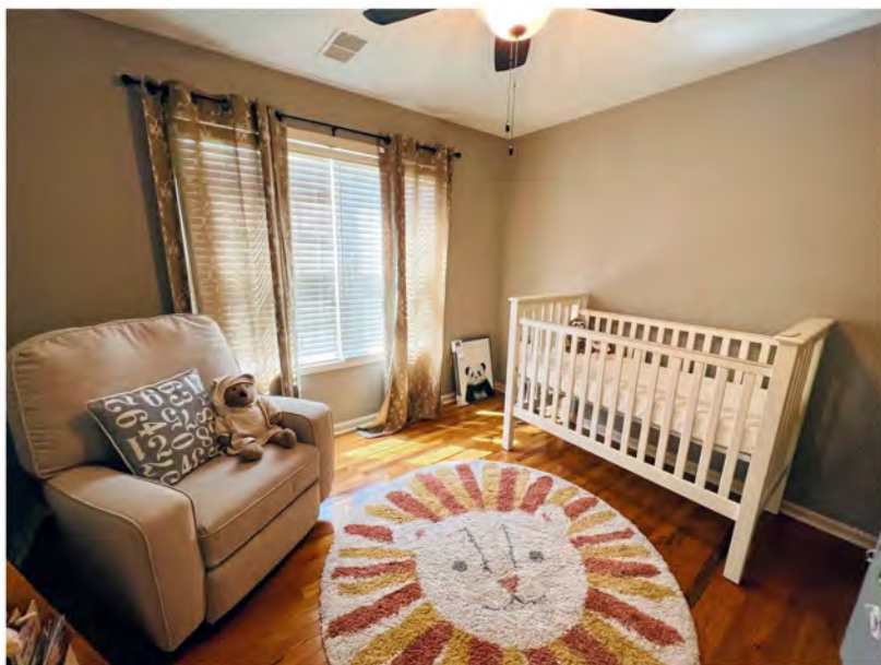
Bedroom for baby., We can't wait until it's full of laughter, bedtime stories, and playtime.