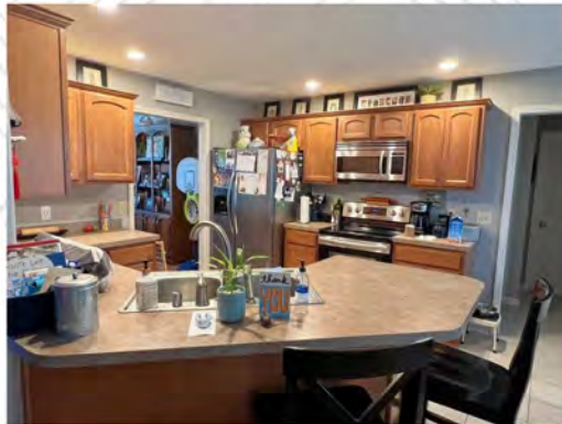
Our kitchen, where we cook together and have family dance parties.