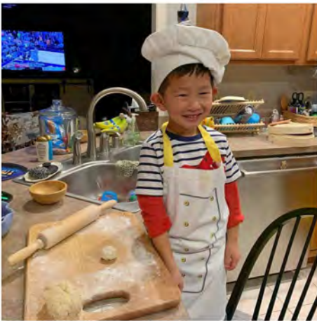
Our little Chef in the kitchen.