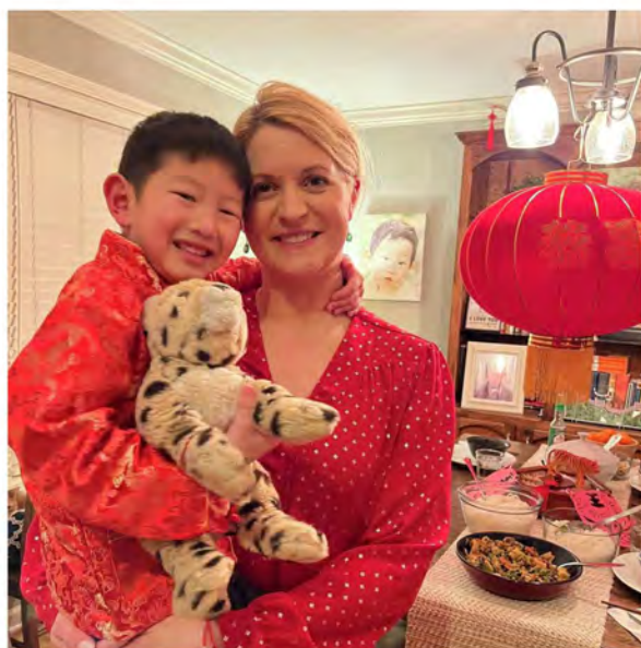
Celebrating Chinese New Year