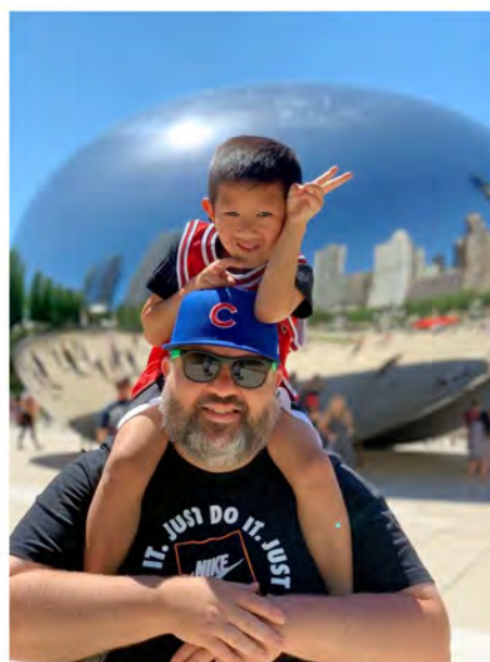
Visiting The Bean sculpture in Chicago, IL