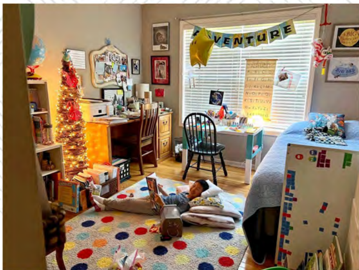
Office and homeschooling room.