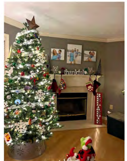
Christmas time in front of the fireplace.