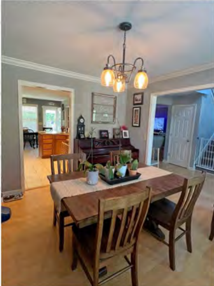
Our dining room where we celebrate special occasions and play the piano.