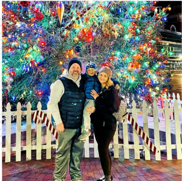
We love to visit the big Christmas tree downtown every year.