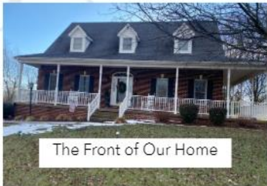
The Front of Our Home