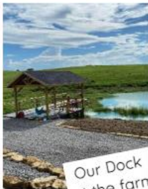
Our Dock at the farm