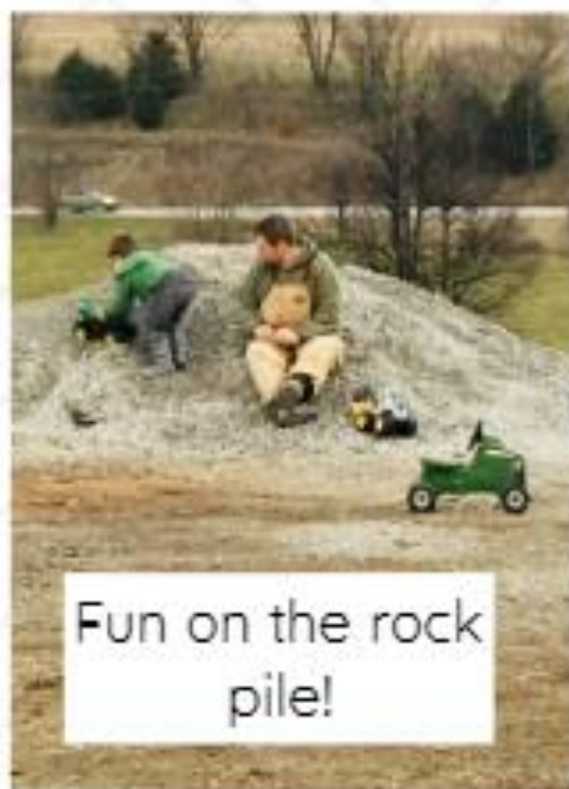
Fun on the rock pile!