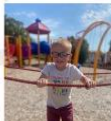
Playing at the park. A short walk or golf cart ride away!