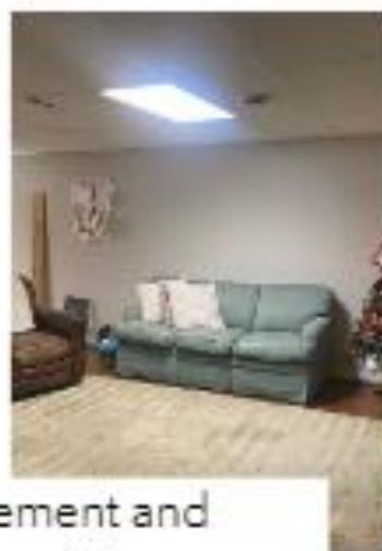
Our basement and Playroom. Lots of time spent here!