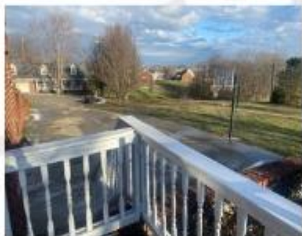
Our Basketball Area & side yard in the cul-de-sac of our street