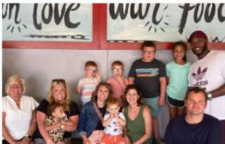
Enjoying time on our family vacation