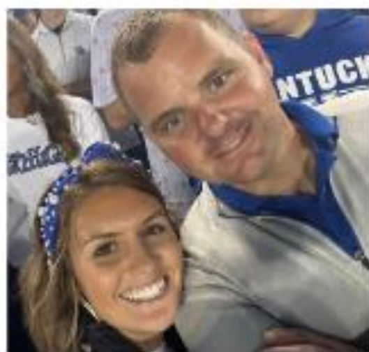
Cheering on the Wildcats!