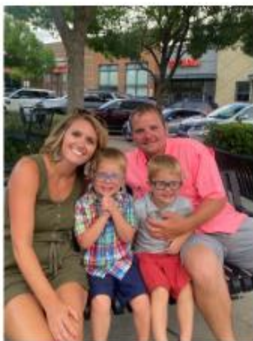
Enjoying time on a family vacation!