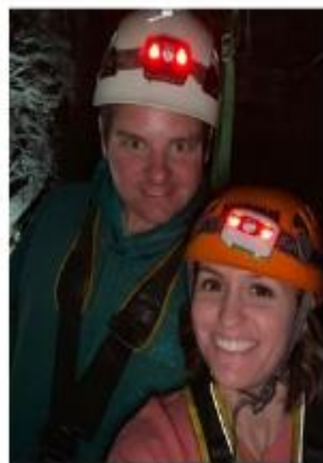
Always up for any adventure. Ziplining fun!