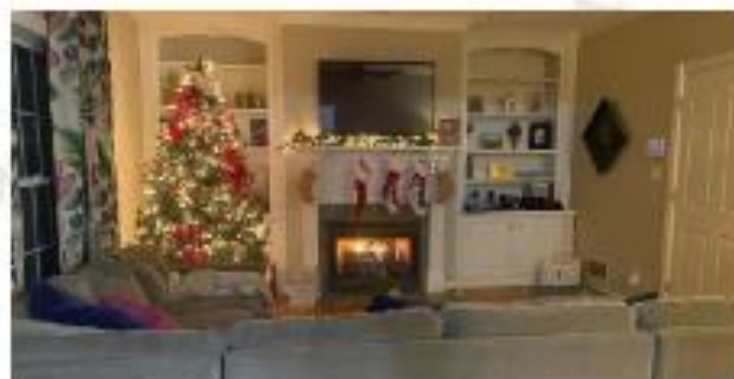
Our Living Room