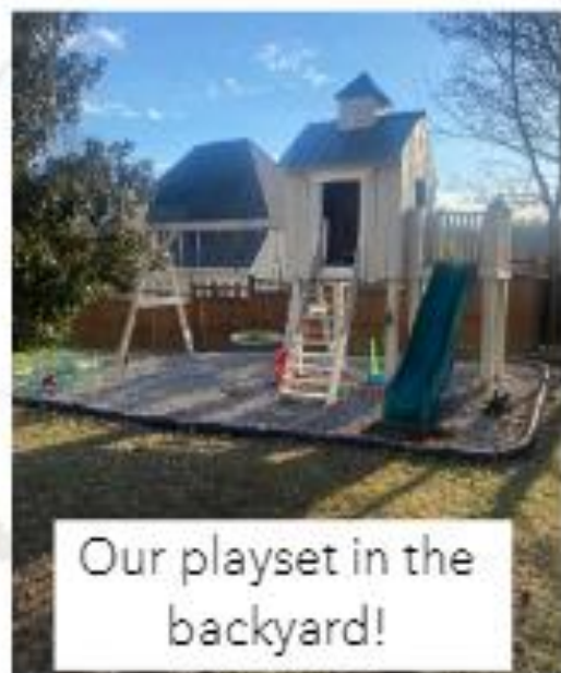
Our playset in the backyard!