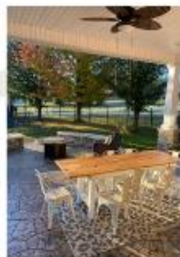
Our Back Patio