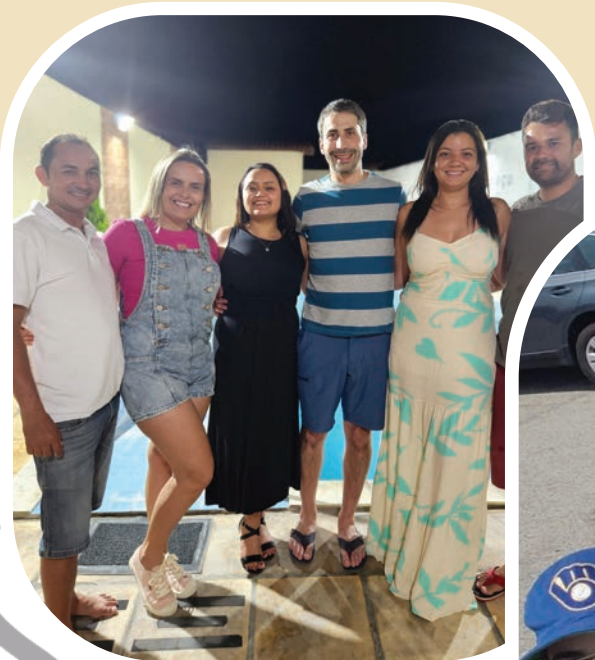
Visiting with friends in Brazil