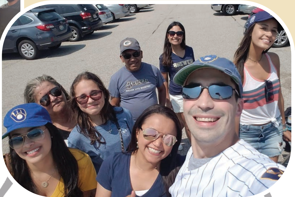
Brazilian friends visiting us in the US