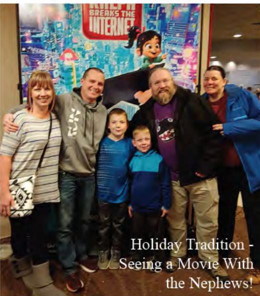
Holiday Tradition - Seeing a Movie With the Nephews!