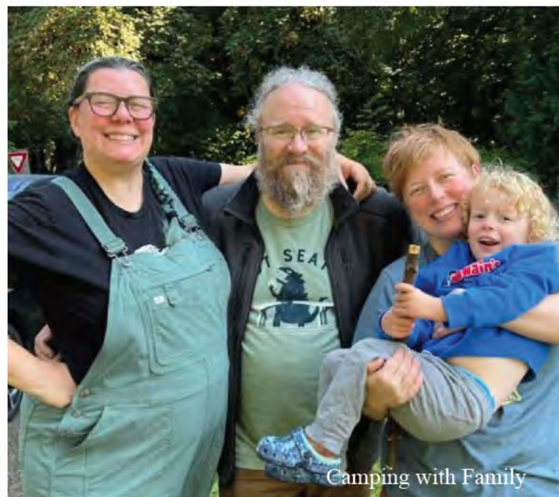
Camping with Family