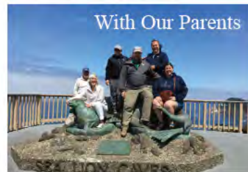
With Our Parents

Matt's parents recently flew the whole family out to visit and celebrate their 50th wedding anniversary and we rented a big house near Port Angeles on the Olympic Peninsula. We explored ocean beaches, hiked in the mountains and roasted marshmallows over the fire. Jen grew up in Port Angeles, and especially enjoyed sharing some of her favorite spots as well as her knowledge of tide pool creatures and forest ecology with everyone.