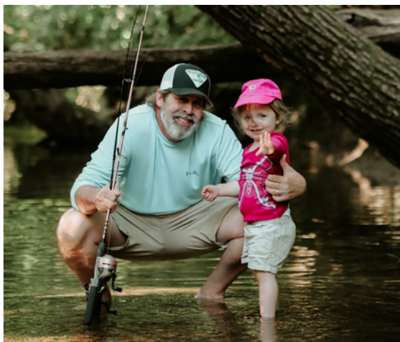
DADDY DAUGHTER FISHING