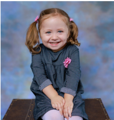
PRESCHOOL PHOTO DAY