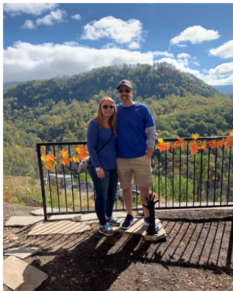
GREAT VIEWS AT GATLINBURG