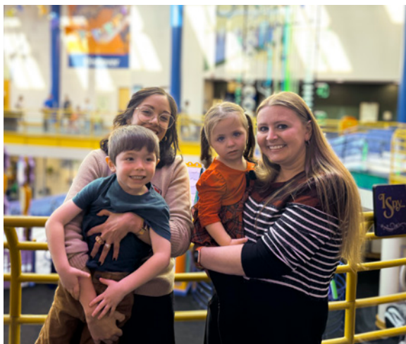
WITH A FRIEND AND HER SON AT THE CHILDREN'S MUSEUM