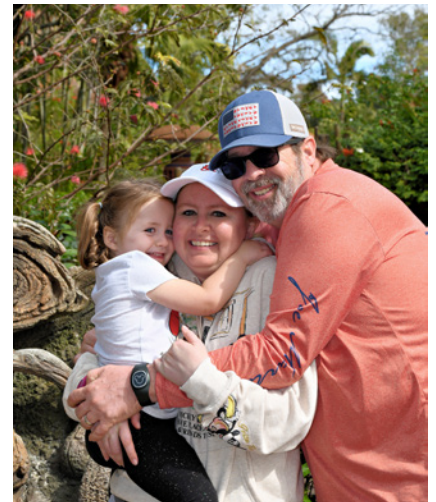
LOVE MADE US A FAMILY, ADOPTION MADE US THREE