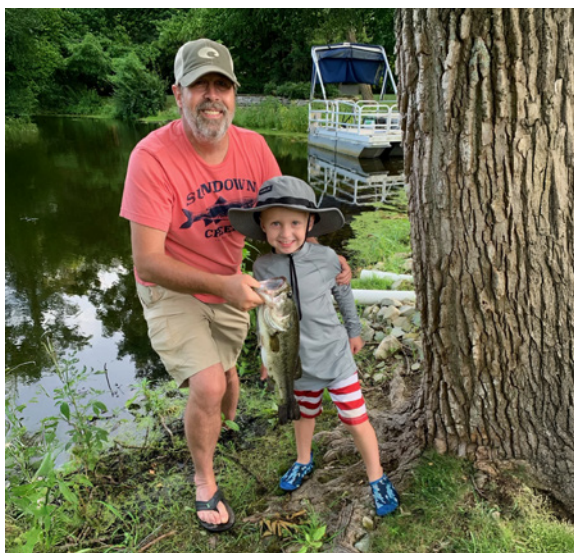
WHAT A CATCH! FISHING IN OUR POND WITH OUR COUSIN'S SON