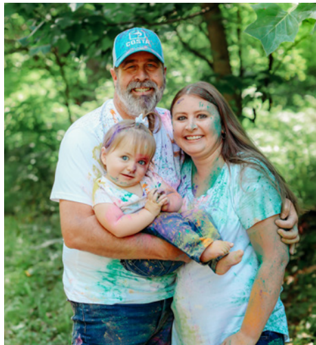
COLORFUL FAMILY FUN