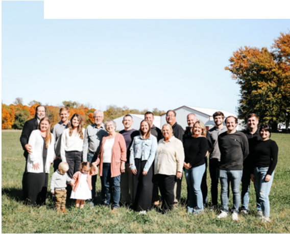
GARY'S SIDE OF THE FAMILY