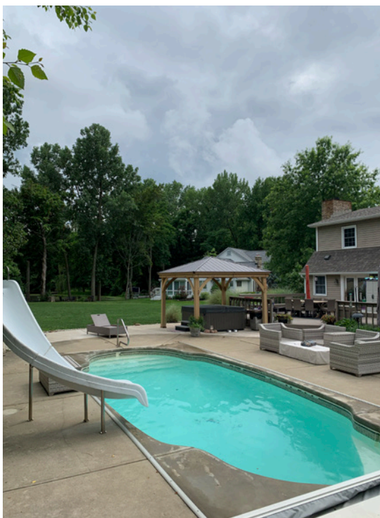
OUR BACKYARD WE CALL "THE O'ASIS"

Our charming two-story home sits on a quiet cul-de-sac surrounded by wonderful neighbors with whom we are very close with. It features an in-ground pool, a wooden play set, a sandbox, an inflatable bounce house with water slides, canons and splash zone, a hot tub, and a private pond for fishing. It's truly a perfect home for family fun. The spacious yard is great for our rescue pups, Kora and Kira, and a safe haven for children to learn, grow, and flourish.