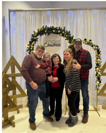
CHRISTMAS EVENT IN TOWN