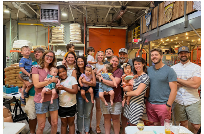
GET TOGETHER WITH OUR GOOD FRIENDS AND FELLOW ADOPTIVE FAMILIES