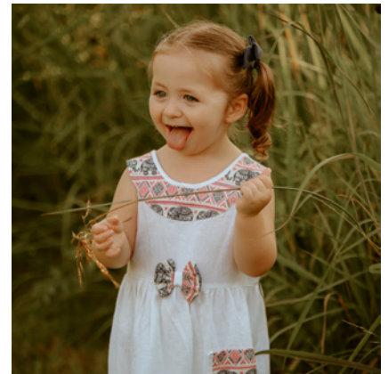
SWEET AND SILLY