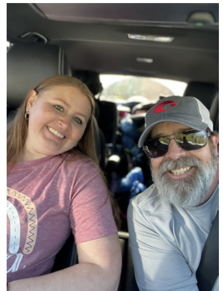
CAR PACKED AND HEADED OUT ON VACATION