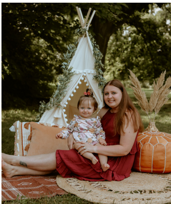
POSING WITH EMERSON