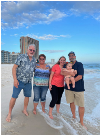
WE LOVE FAMILY VACATIONS