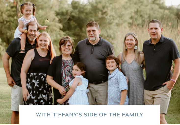
WITH TIFFANY'S SIDE OF THE FAMILY