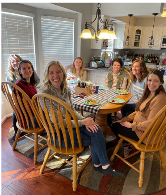
BRUNCH WITH OTHER ADOPTIVE MOMS! SHARING LAUGHS, SUPPORT, AND THE JOURNEY