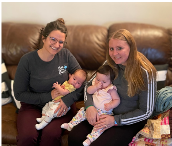
CATCHING UP WITH A GOOD FRIEND WHO IS ALSO AN ADOPTIVE MOM