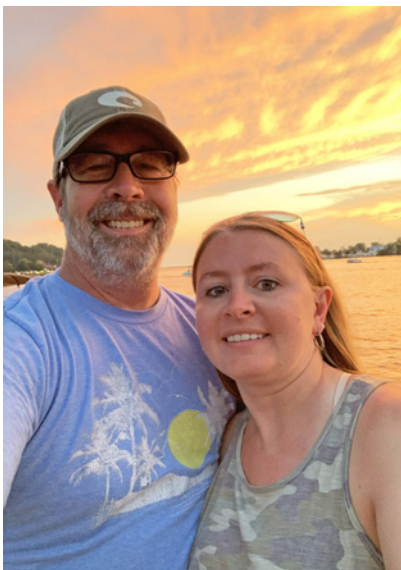
SUNSET AT THE LAKE

Even with all our adventures, home is our favorite place. We love hosting pool parties, cookouts, and holidays with family and friends. We're so thankful for this life and can't wait to share it with another child.