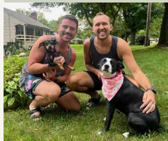
THE DAY LILY JOINED OUR FAMILY!

Callie, the bigger of the two, is the biggest lovebug you'd ever meet. She adores attention from everyone she meets and will snuggle up to you in seconds. Lily, on the other hand, is more reserved initially, but her love for treats quickly reveals her affectionate side. These two are truly a part of our family and are always by our side, including on some of our favorite vacations in which we've gotten to take them along with us on, such as to the Poconos and Upstate New York. We know that they are going to be the best big sisters to our child as we always love seeing how loving and careful they are with our nieces and nephews.