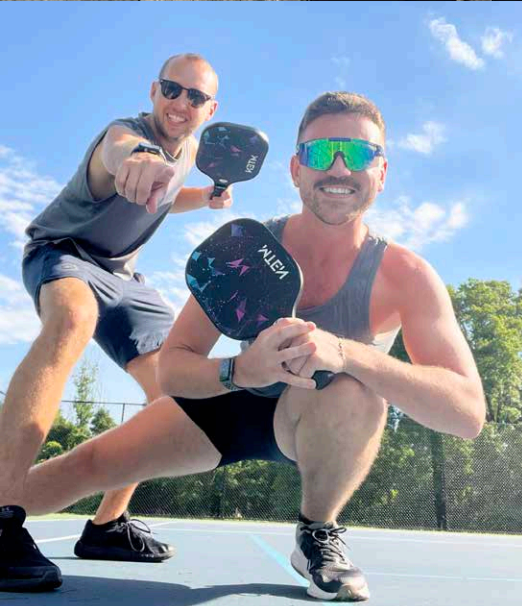
A FRIENDLY GAME OF PICKLEBALL

From the moment we met, there was an undeniable connection. We quickly bonded over our close relationships with our families and shared interests, such as being adventurous, finding fun in any situation, and leading an active lifestyle. Early in our relationship, we successfully navigated long-distance dating three separate times, which helped strengthen our communication and has been a key factor in maintaining a strong, healthy relationship. Over the years, we've purchased our home, got married in 2024, and rescued two incredible pups. When we're not spending time at home, we love exploring new places, enjoying our community, and visiting our families who live nearby.