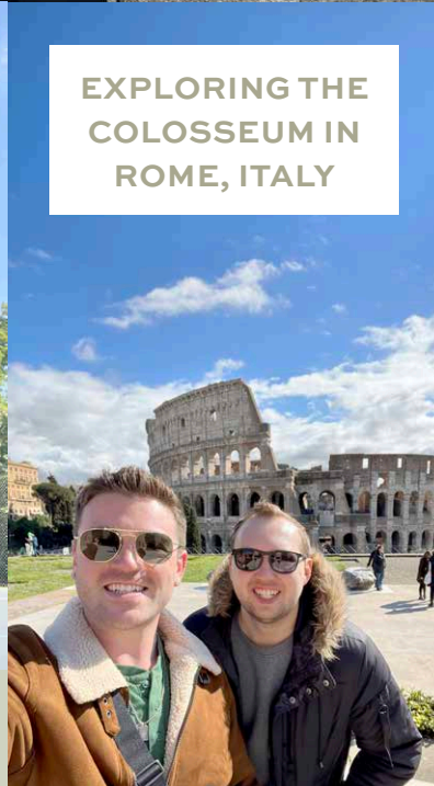
EXPLORING THE COLOSSEUM IN ROME, ITALY