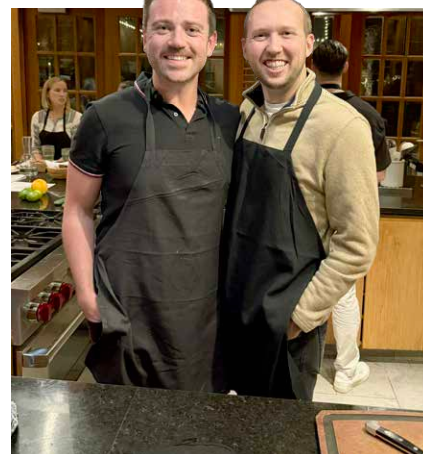
HAVING A BLAST TOGETHER AT A COOKING CLASS