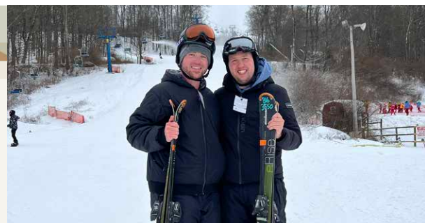
WE LOVE TO SKI DURING THE WINTER

We love to travel to new places, our favorite vacation was to Thailand—where we stayed in Bangkok and Phuket.