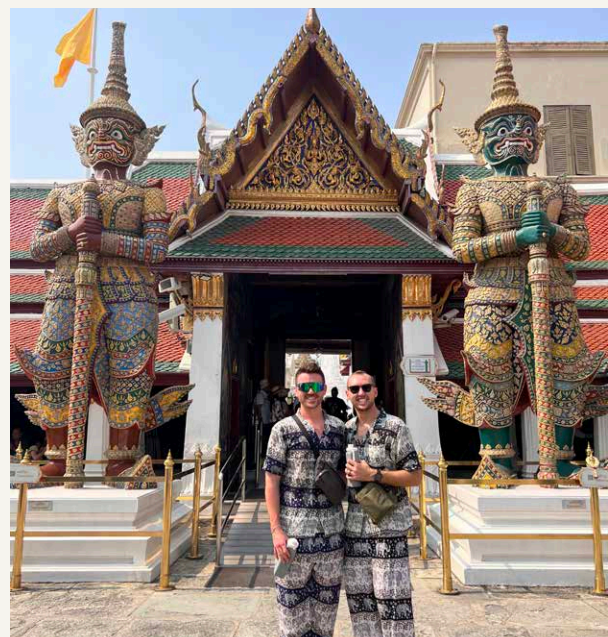
SIGHTSEEING AT THE GRAND PALACE IN BANGKOK, THAILAND