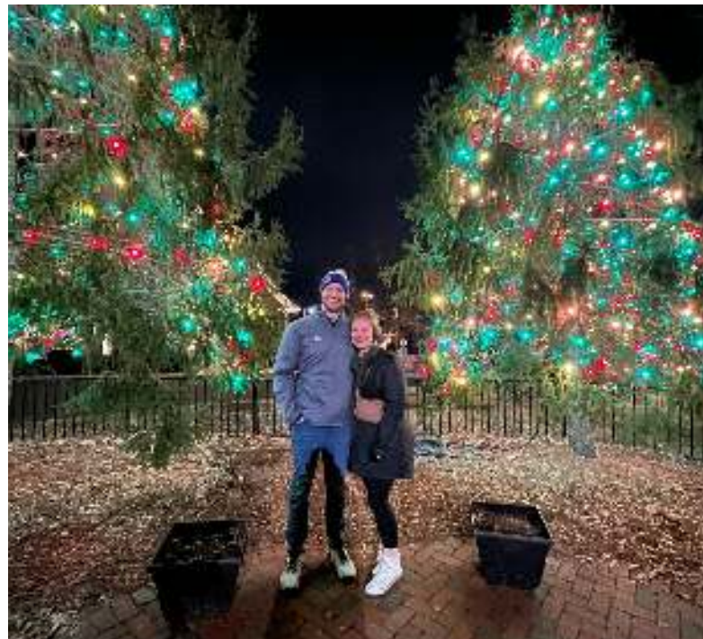
Visiting the Christmas Lights at a neighboring town!

We are eager to carry on these traditions with our child while also creating new ones as a family!