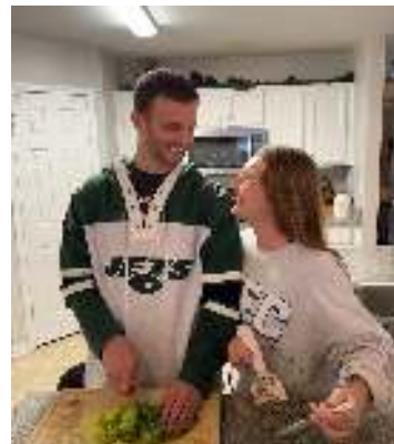
We spend lots of time in our kitchen cooking, baking, and meal prepping.