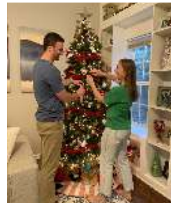
Decorating our tree in the family room.