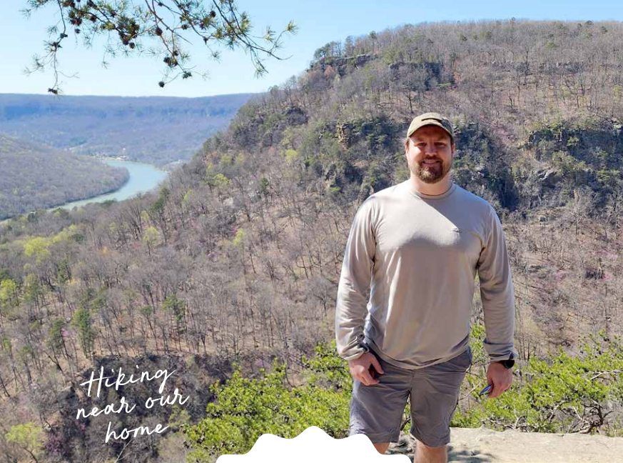
Hiking near our home