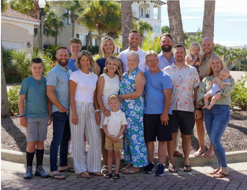
FAMILY VACATION IN DESTIN, FLORIDA WITH KEVIN'S SIDE OF THE FAMILY

Our Family IS WARM, CLOSE-KNIT, AND FULL OF HEART.