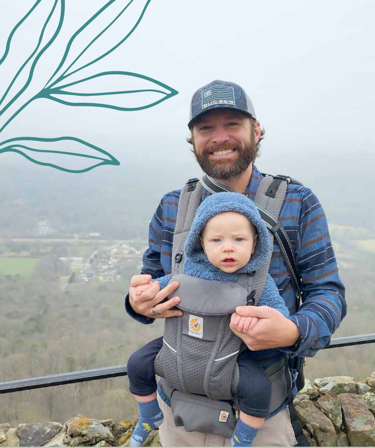
HIKING WITH OUR NEPHEW