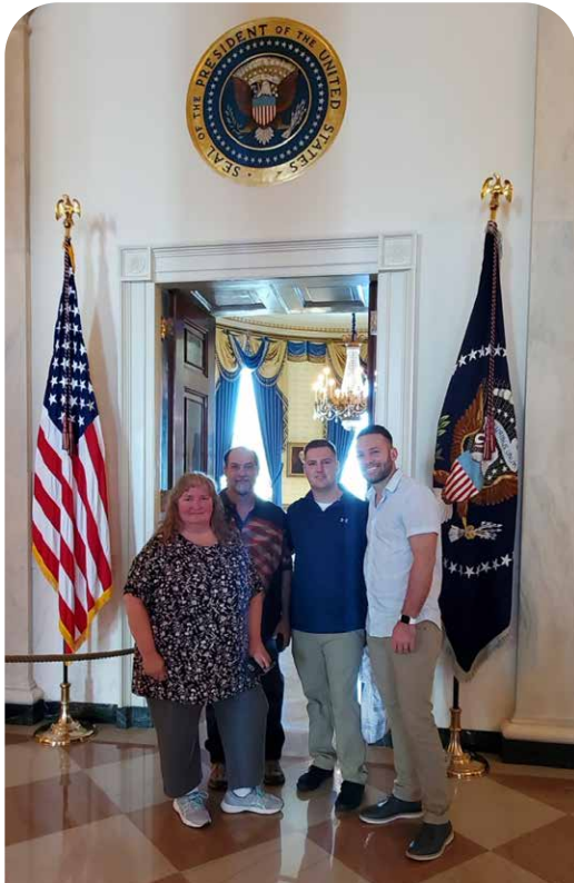
TOURING THE WHITE HOUSE WITH MATT'S PARENTS