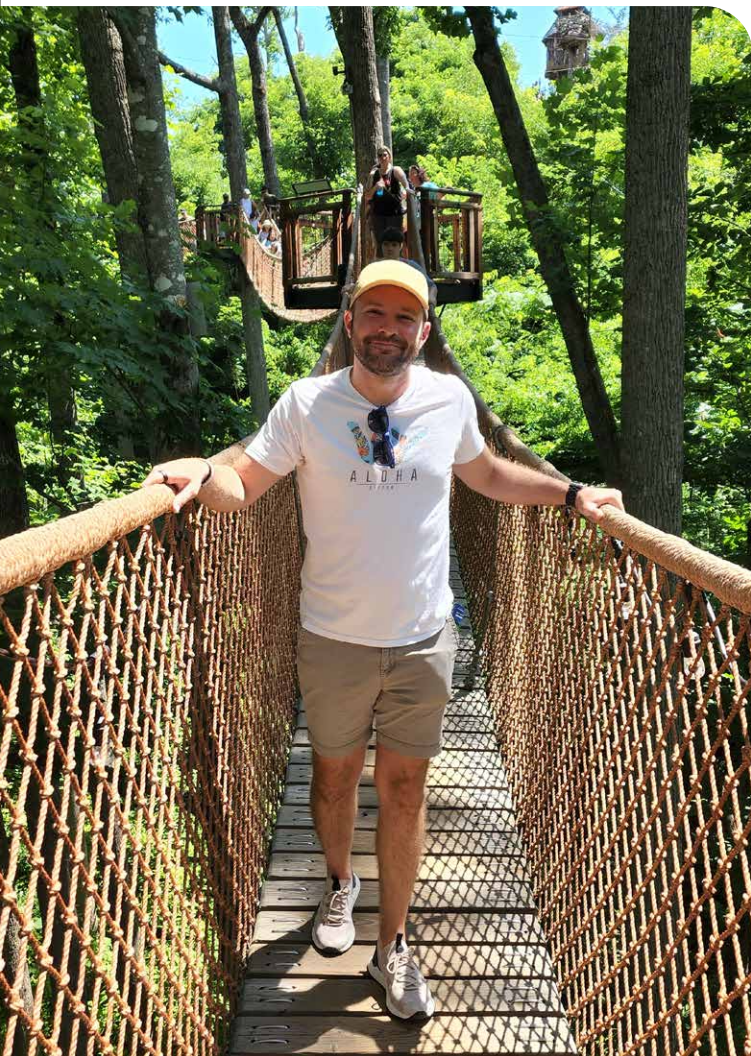
AT ANAKEESTA THEME PARK IN GATLINBURG, TENNESSEE