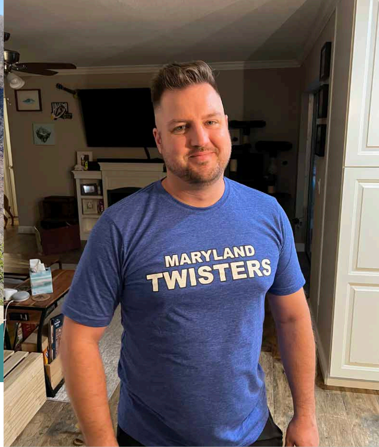
SOMETIMES YOU HAVE TO SHOW OFF A FRESH NEW CUT!