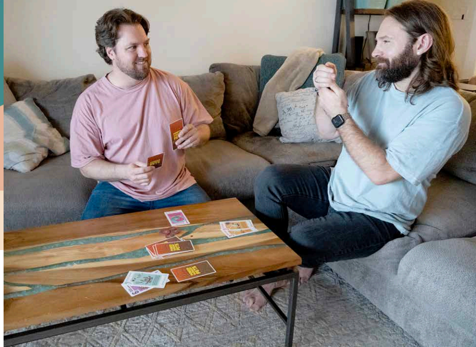
RAINY DAY SHENANIGANS