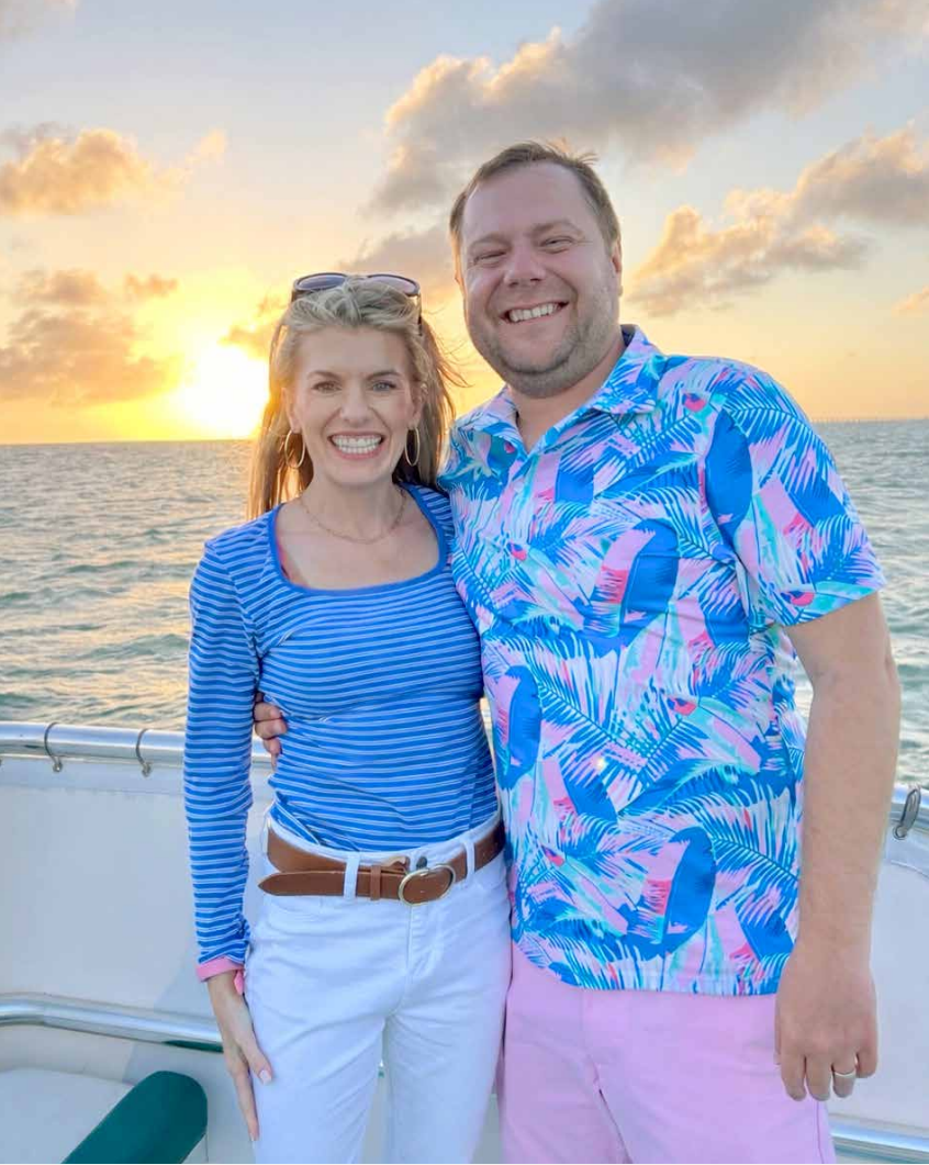
ENDING THE DAY THE BEST WAY — A SUNSET BOAT RIDE ON THE WATER