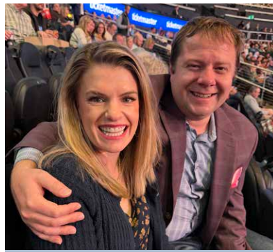
WE ENJOY GOING TO COMEDY SHOWS, IT'S GOOD TO LAUGH!