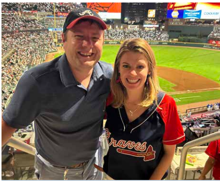
CATCHING A BASEBALL GAME TOGETHER