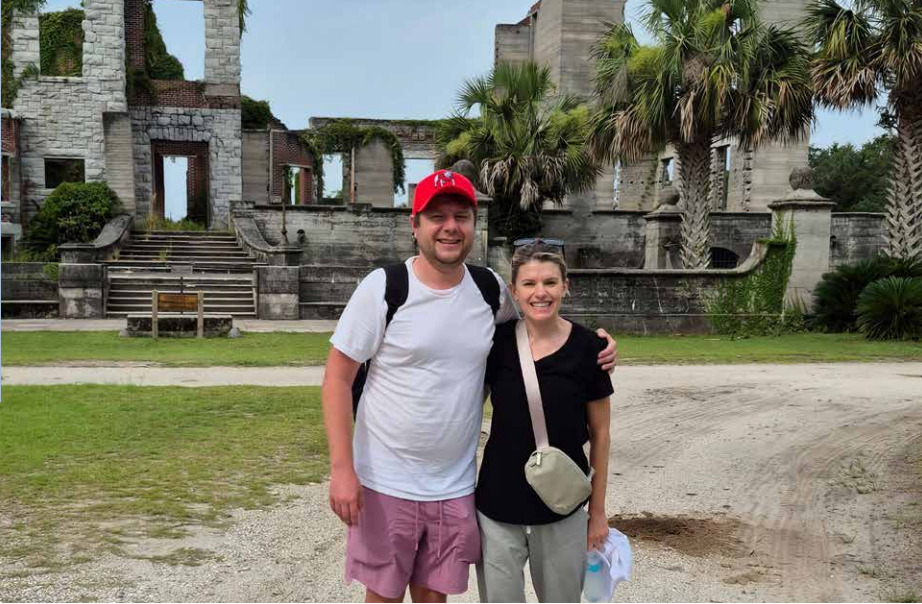
EXPLORING CUMBERLAND ISLAND