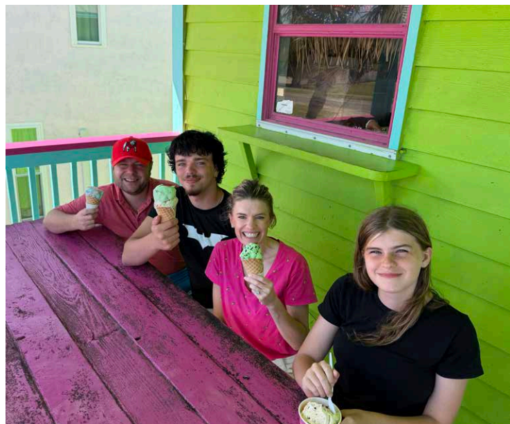
ICE CREAM DATE WITH OUR NIECE AND NEPHEW