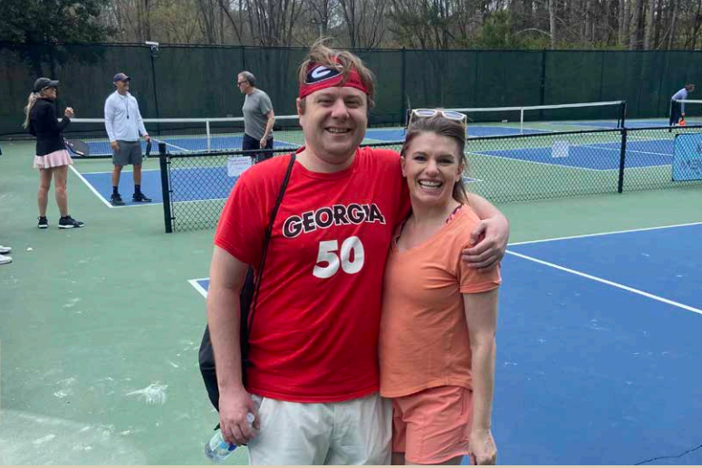
GETTING READY TO PLAY PICKLEBALL