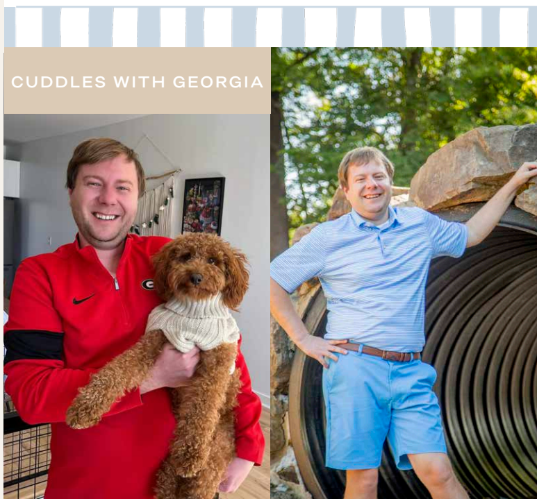
CUDDLES WITH GEORGIA