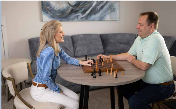
WE LOVE A LITTLE FRIENDLY COMPETITION!